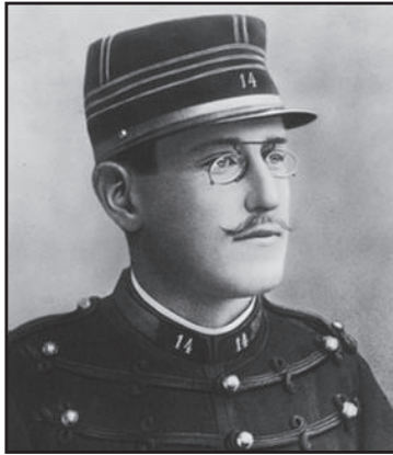
Captain Alfred Dreyfus