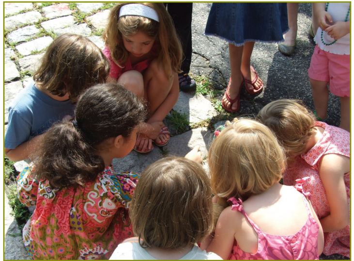
Camp Theo campers observe ants in action...

Friday, 9/24, 5:30pm: Family Movie and Pizza Night Now Showing! Abbott and Costello go to Mars . Ages 5 and up. $5 snack fee per child (adults free). RSVP Lindsay at 421-6970.