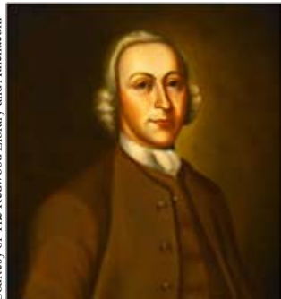
Peter Harrison, Gentleman