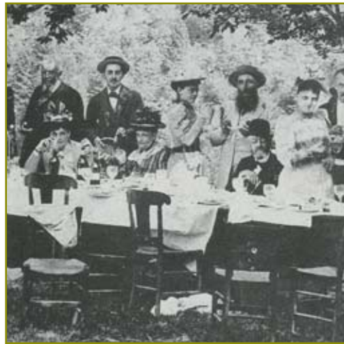
Proust (back row, 3rd from left) and friends celebrate.

and actors weave selections from Ravel, Fauré, Franck, and others whose compositions influenced Proust, with passages from his writing that highlight music's essential role in his book (a recurring musical theme unites characters