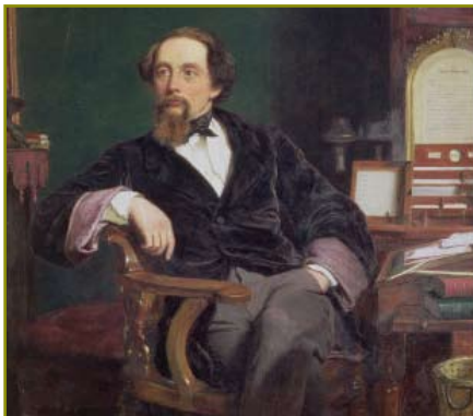
Charles Dickens dreaming of festivities at the Athenaeum.

Could there be a more delightful way to support the Athenaeum, your center for all things Proust?