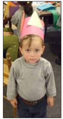
King George Vavrick

WEDNESDAY, MAY 6, 13, 20 AND 27 AT 3:30PM