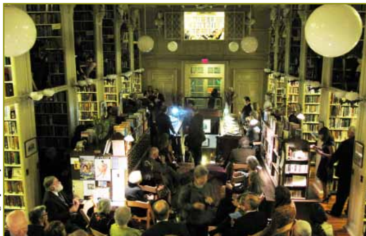
The library is alive with the sound of music!