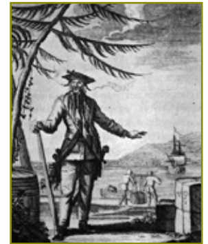
The notorious Blackbeard, from A General History...

Avast, mateys, and hear ye this: ye needn't take to the high seas to find it! Heritage Museum & Gardens in Sandwich, MA will shiver thy timbers with their exciting exhibit, A Short Life and Merry: Pirates of New England , on view through October 31. You'll learn true stories of New England "pyrates", try out life on a pirate ship, sing rousing pirate songs, and handle a genuine gold "piece of eight".